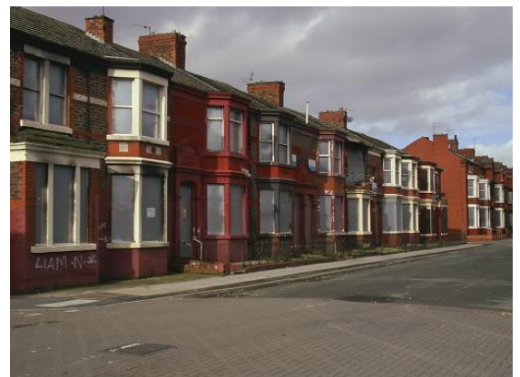
A street of boarded-up houses awaiting demolition, an increasingly common sight throughout Merseyside