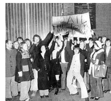
Picket outside Walton Prison

Watch a YouTube video on the rent strike here: http://tinyurl.com/362m92n